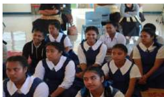
Mo'unga 'Olive College