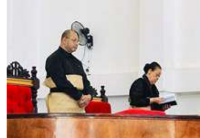
Above: Their Majesties, King Tupou VI and Queen Nanasipau'u, during the Vicennial Anniversary Service of the Office of the Ombudsman, held at the FWC Nuku'alofa, on Sunday, 15th Aug., 2021.