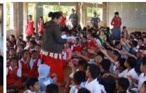
GMS /GPS Vaini