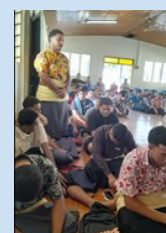
Above & right—OP for students of the Faculty of Education, Arts & Humanity, Tonga National University (TNU).