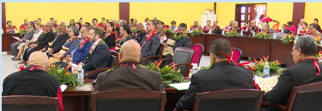
Above: The Hon. Prime Minister Hu'akavameiliku, Hon. 'Alimatea Vaha'I, Ombudsman 'Alisi Taumoepeau, KC., and members of the Diplomatic Corps as well as medical specialists and professors and invited guests at the opening ceremony of the TMZ 80th Anniversary and Annual Conference, 2023.

The Fahina 'o Vaiola is an informal group of female doctors and personnel of the Ministry of Health and wives of doctors who assist doctors. The Commemorative Ladies Breakfast was held to celebrate the 80th Anniversary of TMA, at the Ancient Tonga and attended by health professionals and many guests, the first of its kind. @OMBTonga.