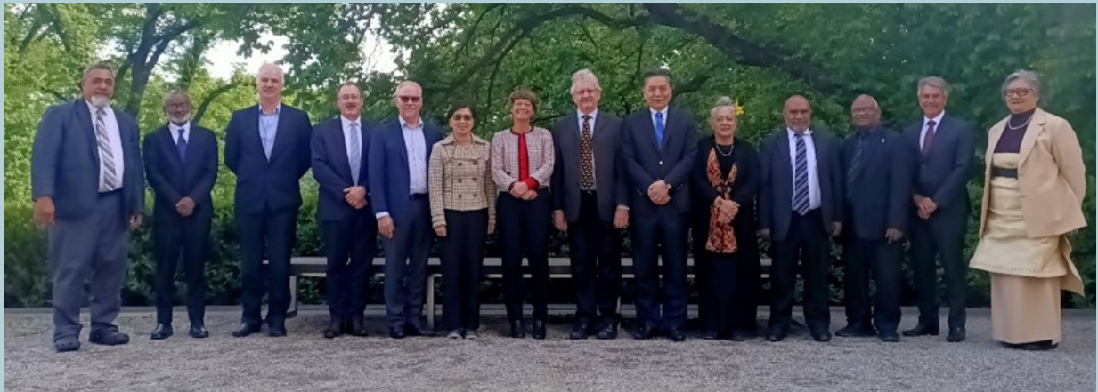
Australasian Pacific Ombudsman Region (APOR) Conference Members, Melbourne, Australia.