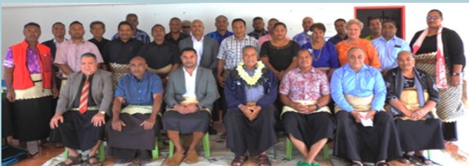
From Left to Right.